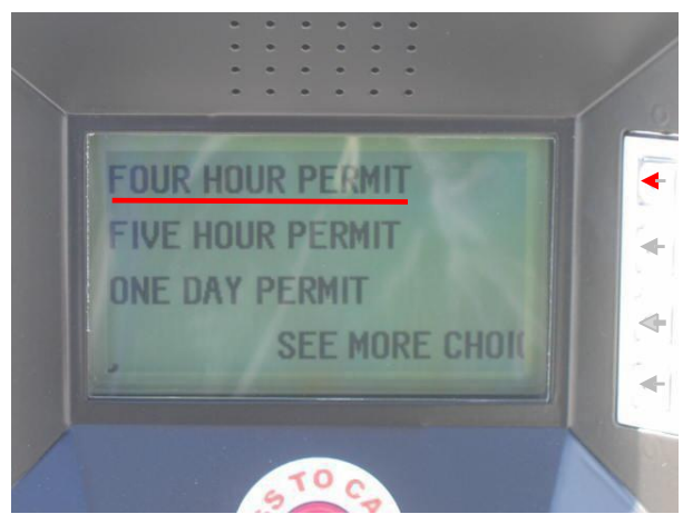
2. Select "Four Hour Permit" (Top Button)