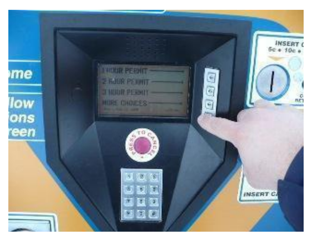
Select "More Choices" (Bottom Button)