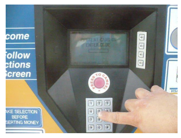
4. Enter the 7 digit coupon code number using the keypad.