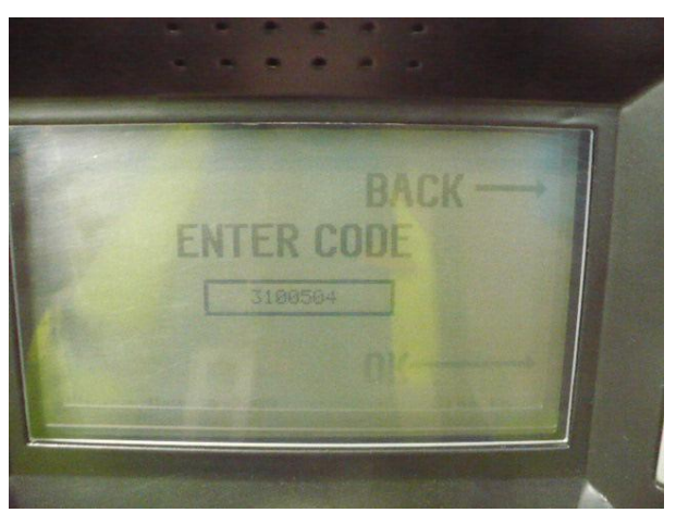
5. Select "OK".