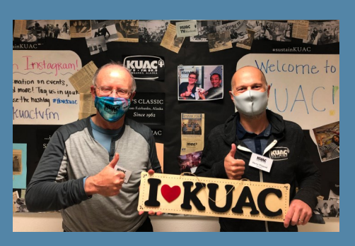
"KUAC is our connection to the world, to a feeling of unity with other countries and the lower 48. It engages our 6 year-old in meaningful discussions, which gives us hope for the next generation!"